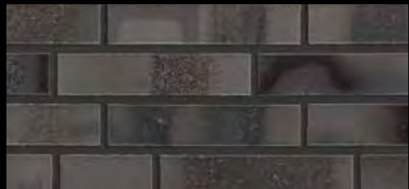
651 aschgrau Δ < 3 % · DIN EN 14411, Gr. AII 0