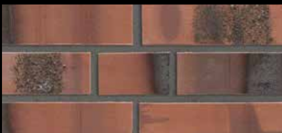
654 flammenrot Δ < 6 % · DIN EN 14411, Gr. AII 0 -Part1