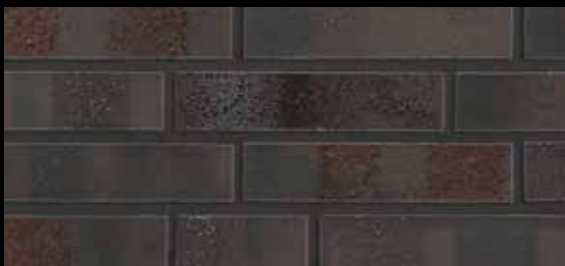
652 moorbraun Δ < 3 % · DIN EN 14411, Gr. AII 0