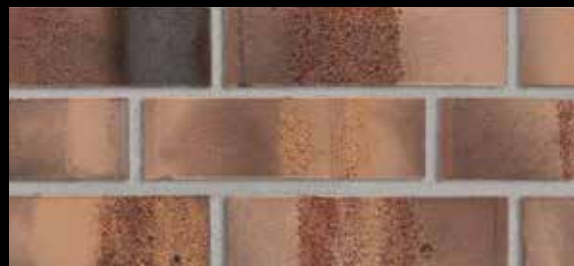
653 kupferrot Δ < 6 % · DIN EN 14411, Gr. AII 0 -Part1