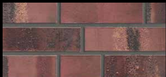
655 violettrot Δ < 6 % · DIN EN 14411, Gr. AII 0 -Part1